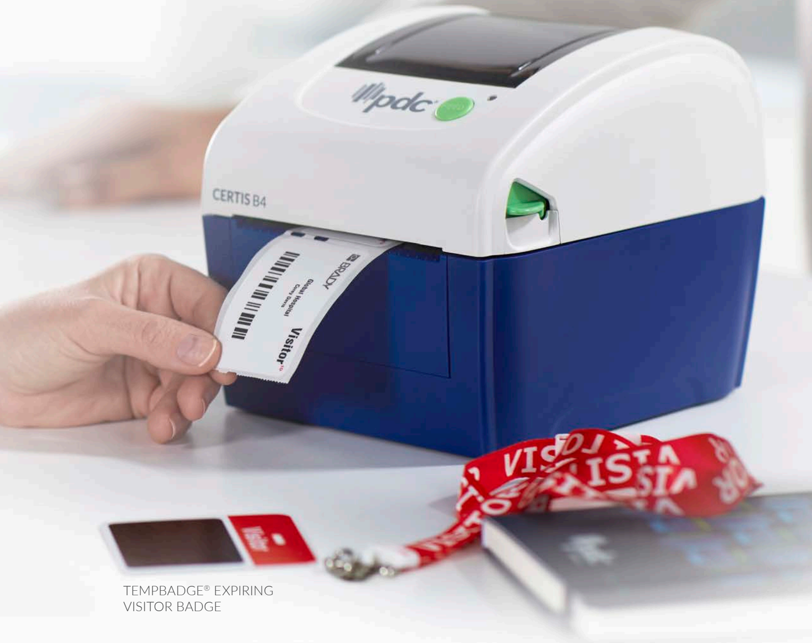
TEMPBADGE® EXPIRING VISITOR BADGE