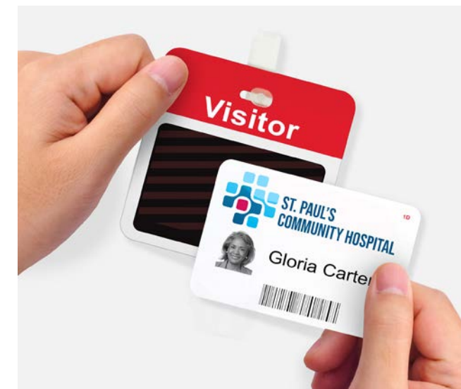
Badge back and front

Clip-On Style Badges with Mix & Match Versatility