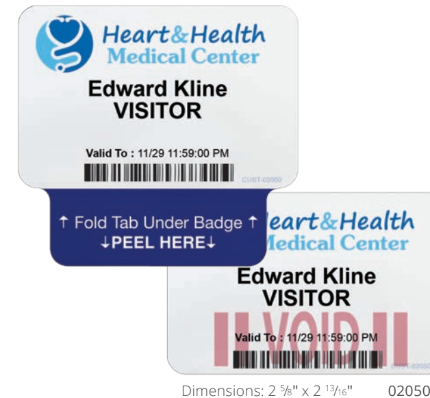
Dimensions: 2 5/8" x 2 13/16" 02050

Quick & Easy Badges with an Adhesive Backing