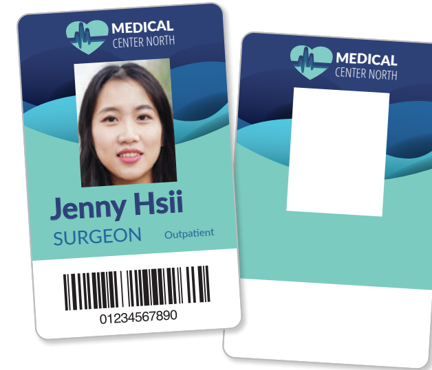
Print variable information on site, while PDC bulk prints your full-color branding.

Let Us Handle Your Bulk Card Printing to Save You Time