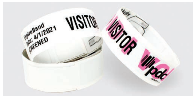
Dimensions: 9 3/4" x 1"

THERMAL PRINTABLE Compatible with PDC Certis® and other leading direct thermal printers