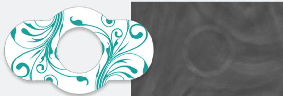
NEW Spee-D-Mark™ 3D Soft Mark

PDC offers breast health professionals the ability to choose the marker that best fits their needs